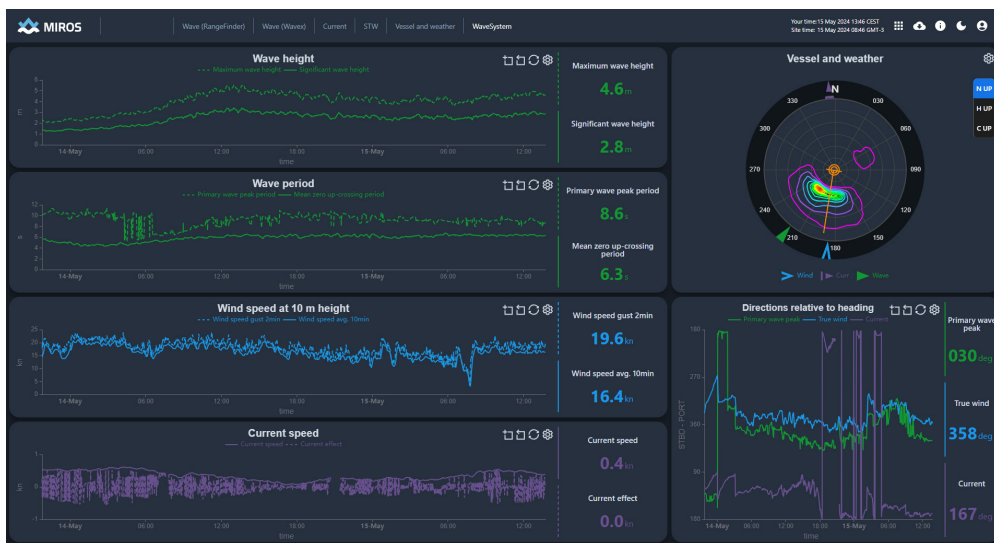
Example of a miros.app dashboard in desktop view for vessel operations.